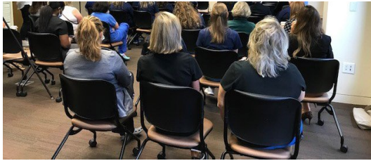
Virtua Voorhees TeamBirth NJ Launch event on Monday, 9/13.*