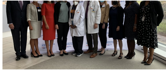
RWJBarnabas Health Cooperman Barnabas TeamBirth NJ Launch event on Monday, 9/12.