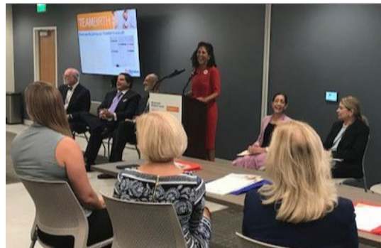
RWJBarnabas Health Monmouth Medical Center TeamBirth NJ launch event on Monday, 9/12.*