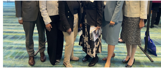
Holy Name Medical Center